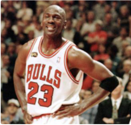
Karl Malone respects Michael bad SOB, too' Sporting News