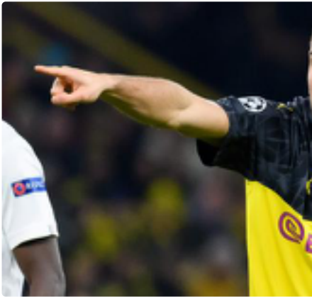
Emre Can sends Sancho Man City admits he could never join R Goal.com

"As a driver, you always want to win races and if you don't go into a new season feeling you can win, then you won't do.