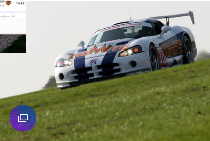
GT champion takes Audi seat after Blundell's exit

"The test I did in the Focus as a reward for winning the title only increased my desire to join the grid, as I felt comfortable straight away and knew that I would be able to do myself justice.